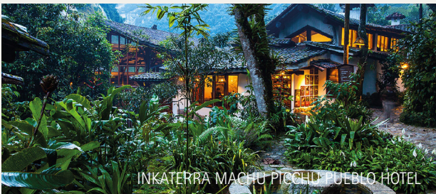
INKATERRA MACHU PICCHU PUEBLO HOTEL