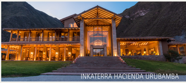
INKATERRA HACIENDA URUBAMBA