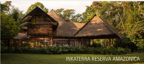
INKATERRA RESERVA AMAZONICA