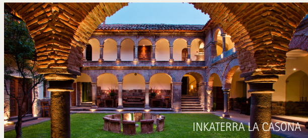
INKATERRA LA CASONA